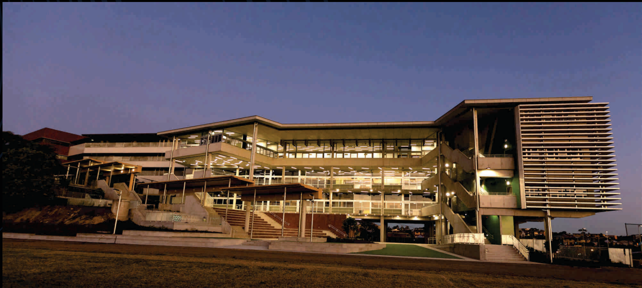
VILLANOVA LEARNING CENTRE PROJECT COST $1.36M (Electrical)

Commercial • Body Corporate • Residential